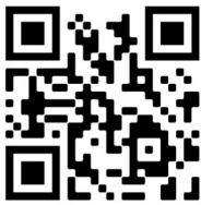
Instruction video on how to upload documents