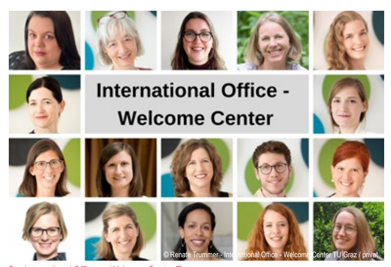
Our International Office - Welcome Center Team