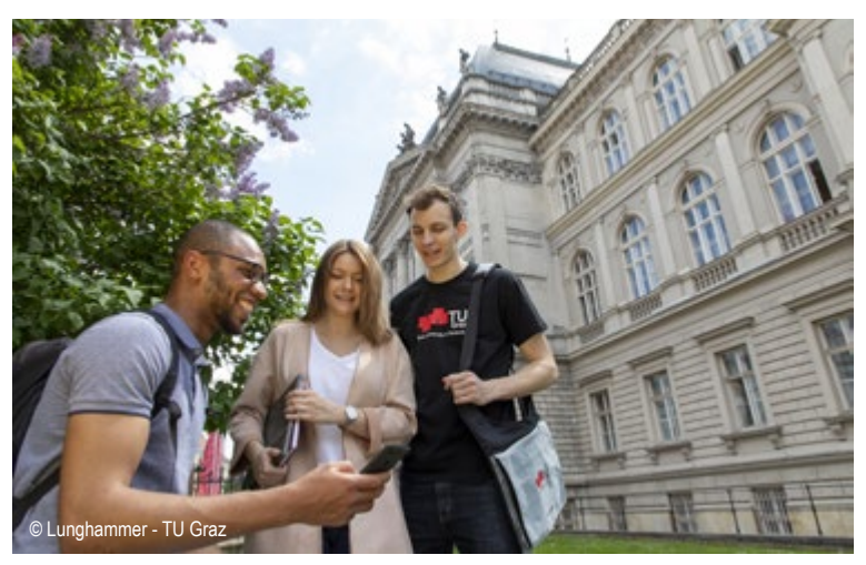
Old Campus - Alte Technik